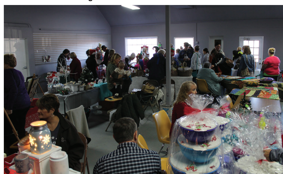
The Anna Arts Center hosted a holiday bazaar which featured many vendors offering items for holiday shoppers.