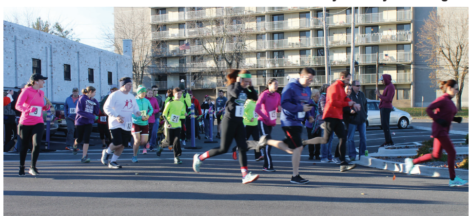
A Reindeer Run/Walk 5K took place outside the Anna Arts Center on Saturday morning, Nov. 25. The 5K kicked off the day-long Christmas in Downtown Anna celebration.

Lots of people – and lots of smiles – were seen during last Saturday's Christmas in Downtown Anna celebration. A wide range of special activities were held. Sunny, mild November weather prevailed as many visitors came to Anna to be a part of the celebration. The accompanying pictures are from some of the Christmas in Downtown activities.