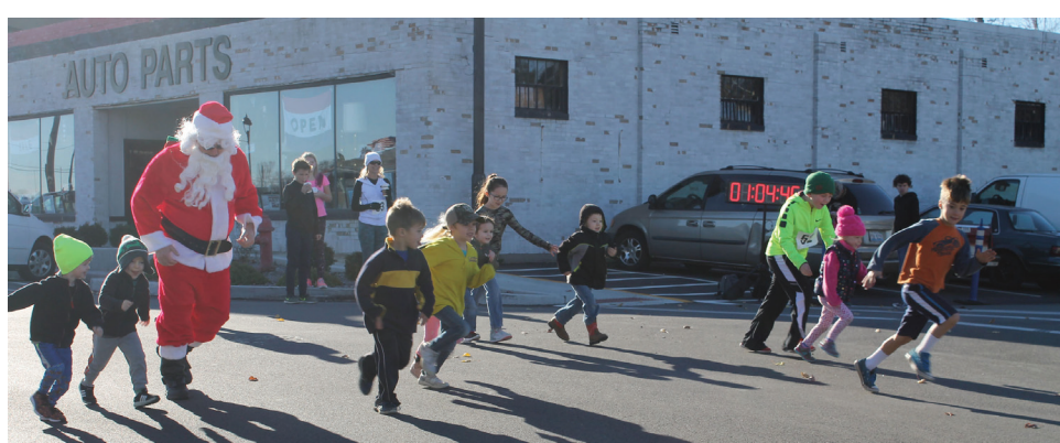
Santa and Rudolph ran with the kids during a Fun Run Saturday morning outside of the Anna Arts Center.