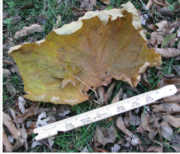
Trophy leaf: Yours truly discovered a trophy leaf during a Black Friday adventure. Those of us who went on the journey think we were looking at a leaf from a sycamore tree. Just for the sake of comparison, a leaf from a sweet gum tree was placed on the big ol' leaf. That's a foot-long ruler under the big ol' leaf. By the time the picture was taken, the leaf was getting just a little bit dry and had started to curl up.

One last thing this week...be sure to check out Christmas in the Village, which is coming up this Saturday in our hometown.