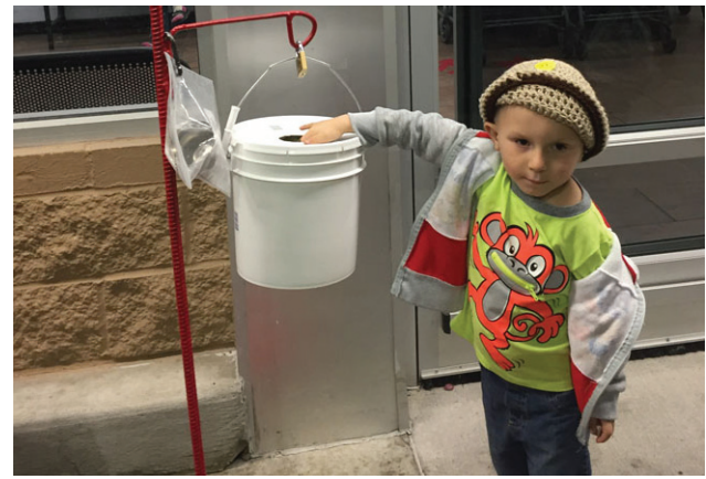
Children love to give to the Union County Alliance of Churches when they hear the bell ring.

anything wrong" with gospel lesson from Matthew.