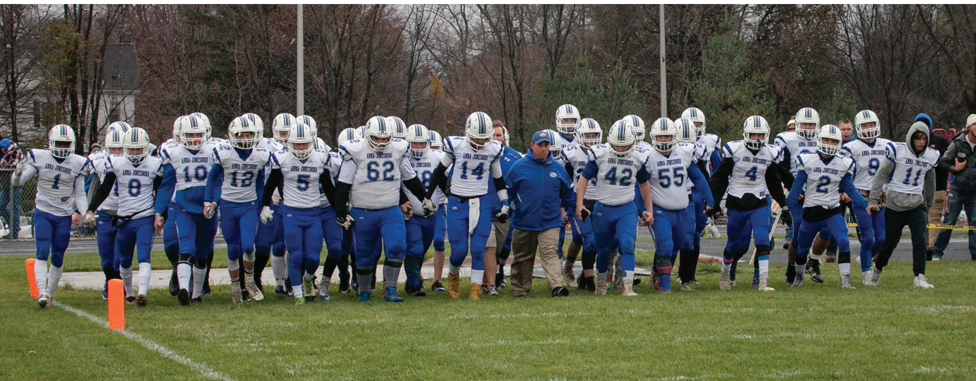
The final walk out of the season The Anna-Jonesboro Community High School Wildcats football team made its final walk out of the 2017 season during a playoff game at Pleasant Plains. The host team scored a victory in the Illinois High School Association Class 3A semifinal round playoff game.