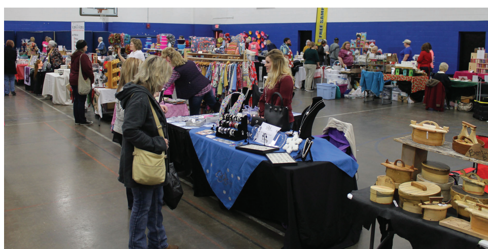
The Anna VFW Auxiliary held a craft/vendor expo in the lower gym at Anna-Jonesboro Community High School. Nearly 50 vendors participated.