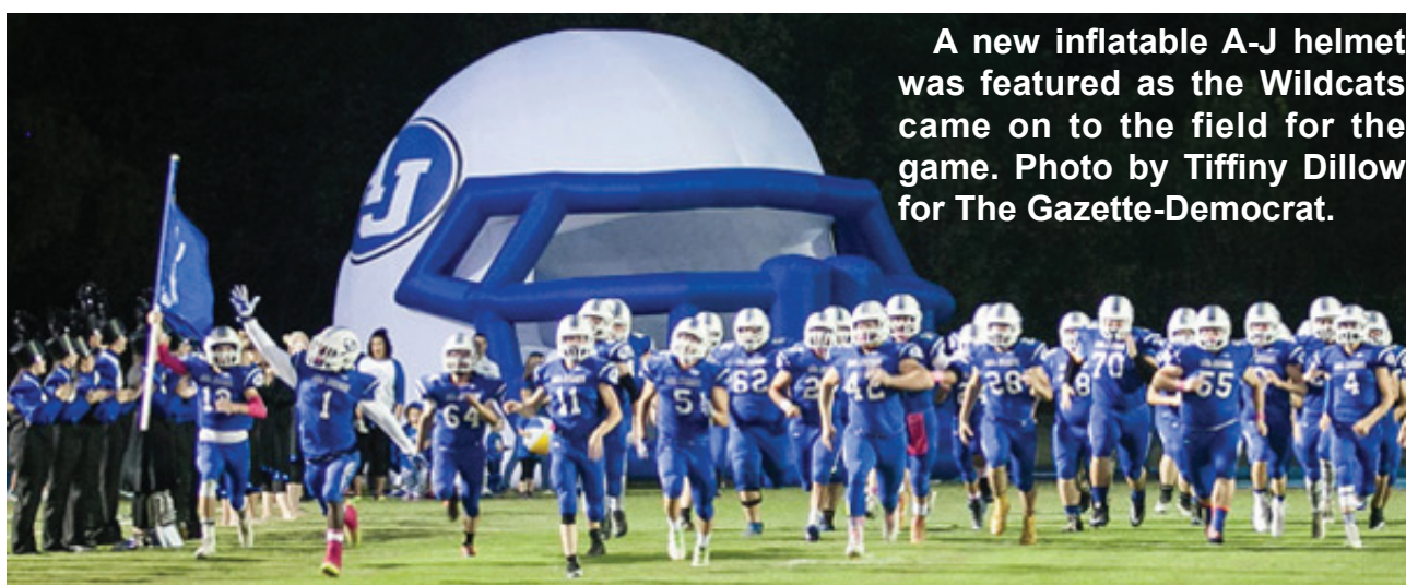
A new inflatable A-J helmet was featured as the Wildcats came on to the field for the game.