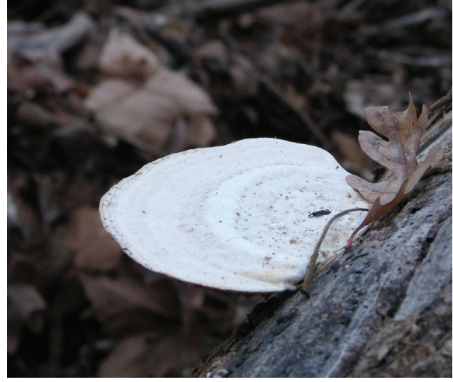
Fungi foto: A white fungi was seen growing on the remains of a large tree which had fallen across a creek bed at the state forest.