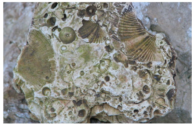
Successful hunt: This image shows a fossil we discovered. The remains of various sea shells and creatures which lived at the bottom of the ocean can be seen in the fossil.

Our journey involved a little bit of hunting, too. Yours truly bagged a nice picture of creatures which