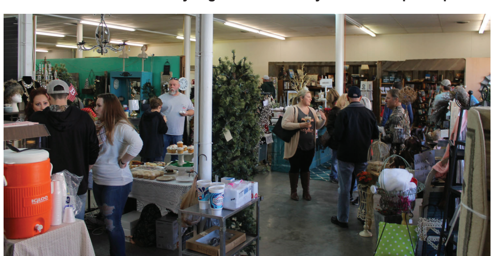
This n That hosted an open house as part of the Christmas in Downtown Anna celebration.