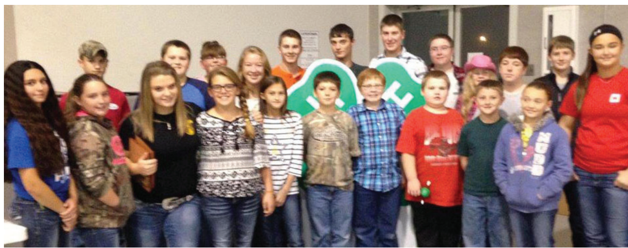
Congratulations to the MCML 4-H Club for winning Union County 4-H Club of the year. They won first for their 4-H window display and first for their float in the Veterans Day parade. They had a good year.