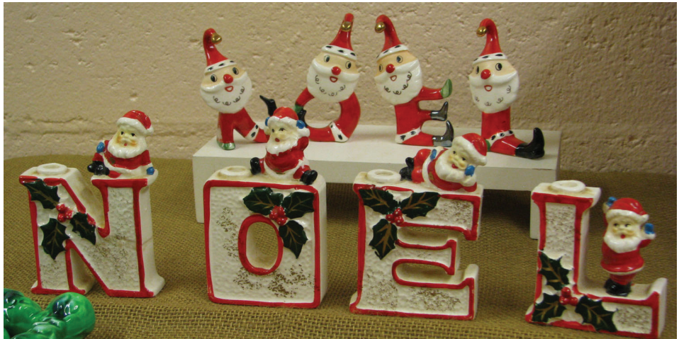
An exhibit at the Union County Historical Society Resource and Cultural Center (the former medical clinic in town) was on display. The display featured a collection of nativity scenes and vintage Noel figures. The Noel figures were from the collection of Patrick Brumleve.