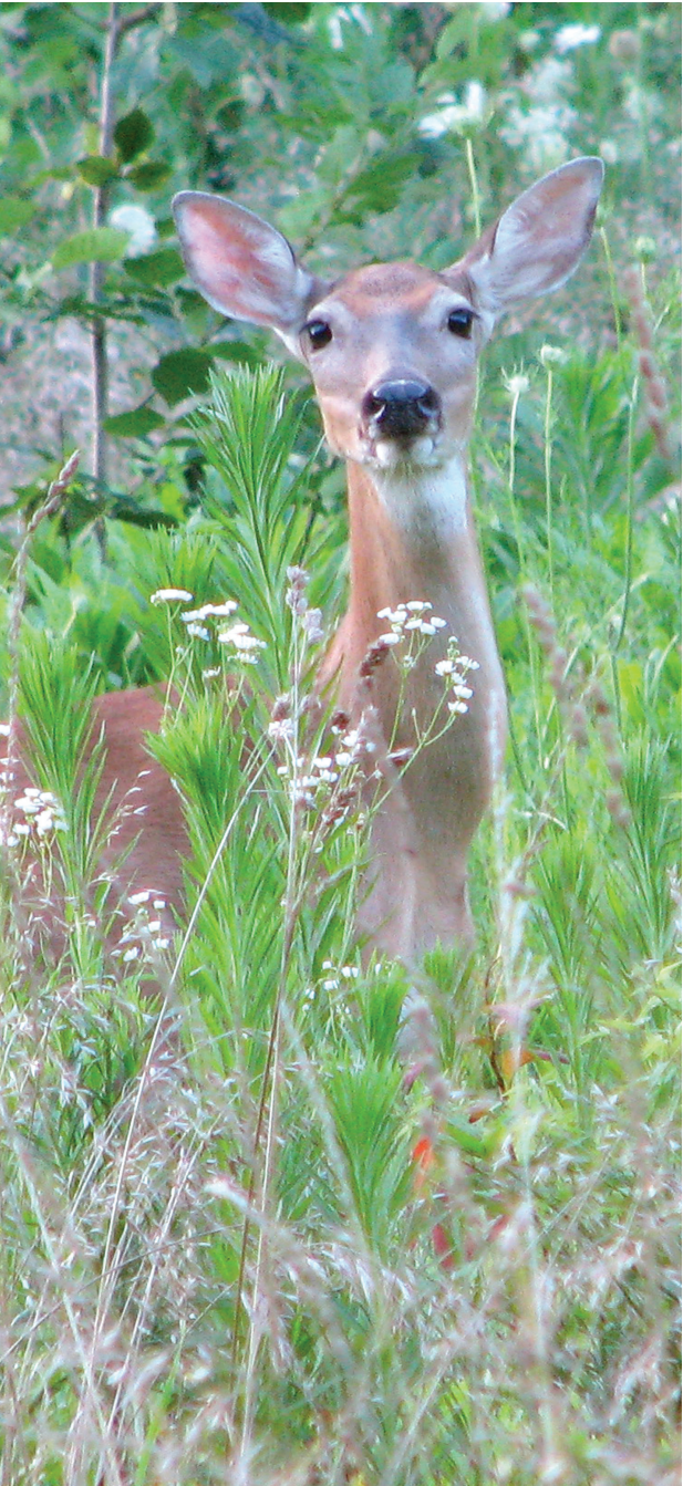
July 9 – Trail of Tears State Forest