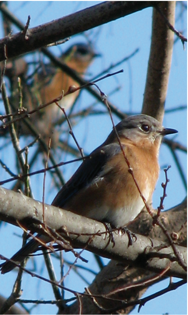
February 5 – Cobden