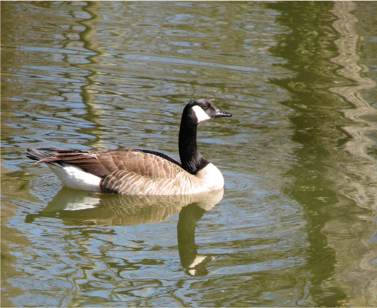
March 2 – Jonesboro