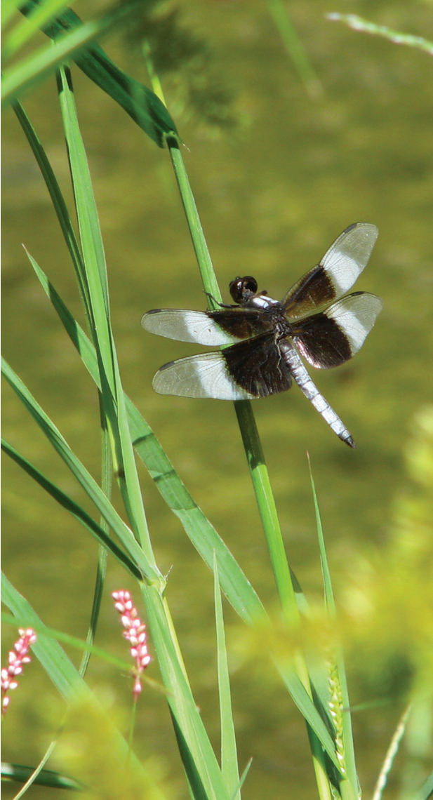
September 7 – Jonesboro