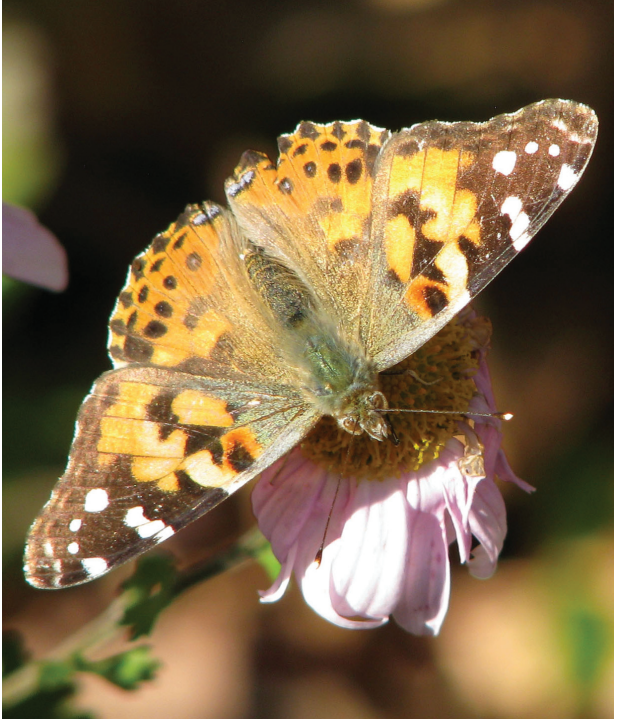
November 25 – Cobden