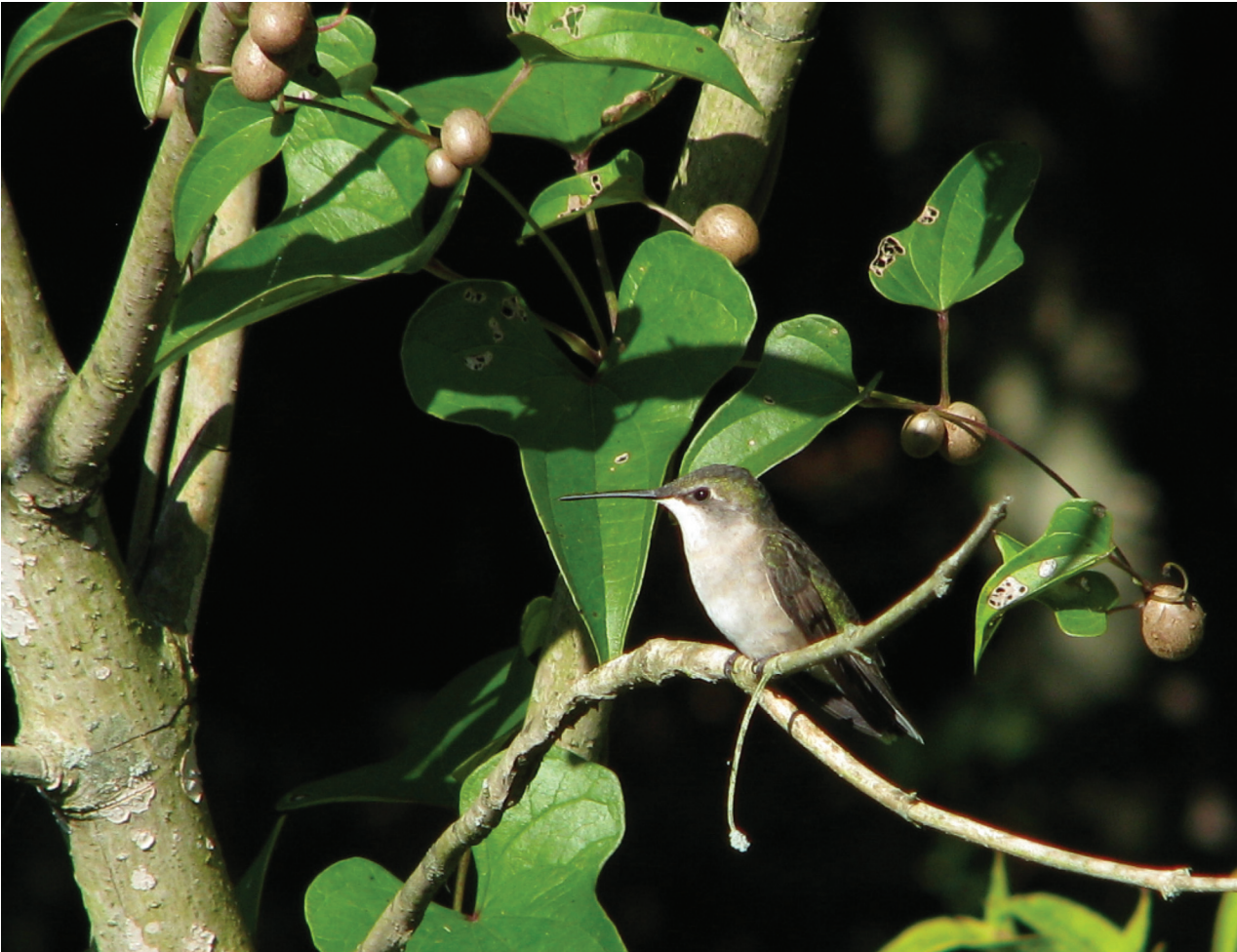
September 2 – Cobden