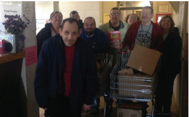
Scout Crew 7751 from Choate collected 158 food items during Scouting for Food. All of the food was donated to the Shawnee Alliance Food Bank. The scouts were proud to do this service project.

Please have news to me by Sunday night. Email me at marthanews@frontier.com, mail to me at 118 W. Monroe St., leave news in the back of the green box at the right of my front door or call me at 833-5717.