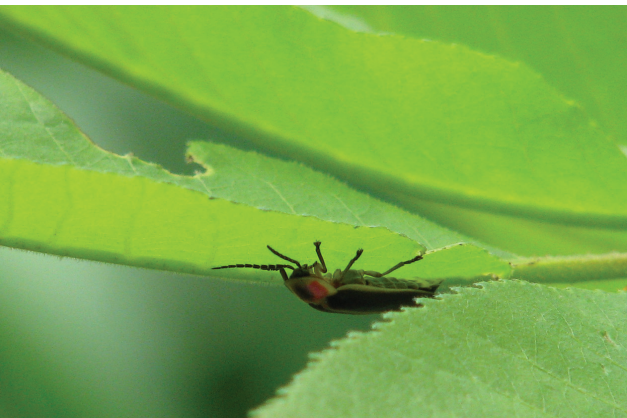
May 27 – Cobden