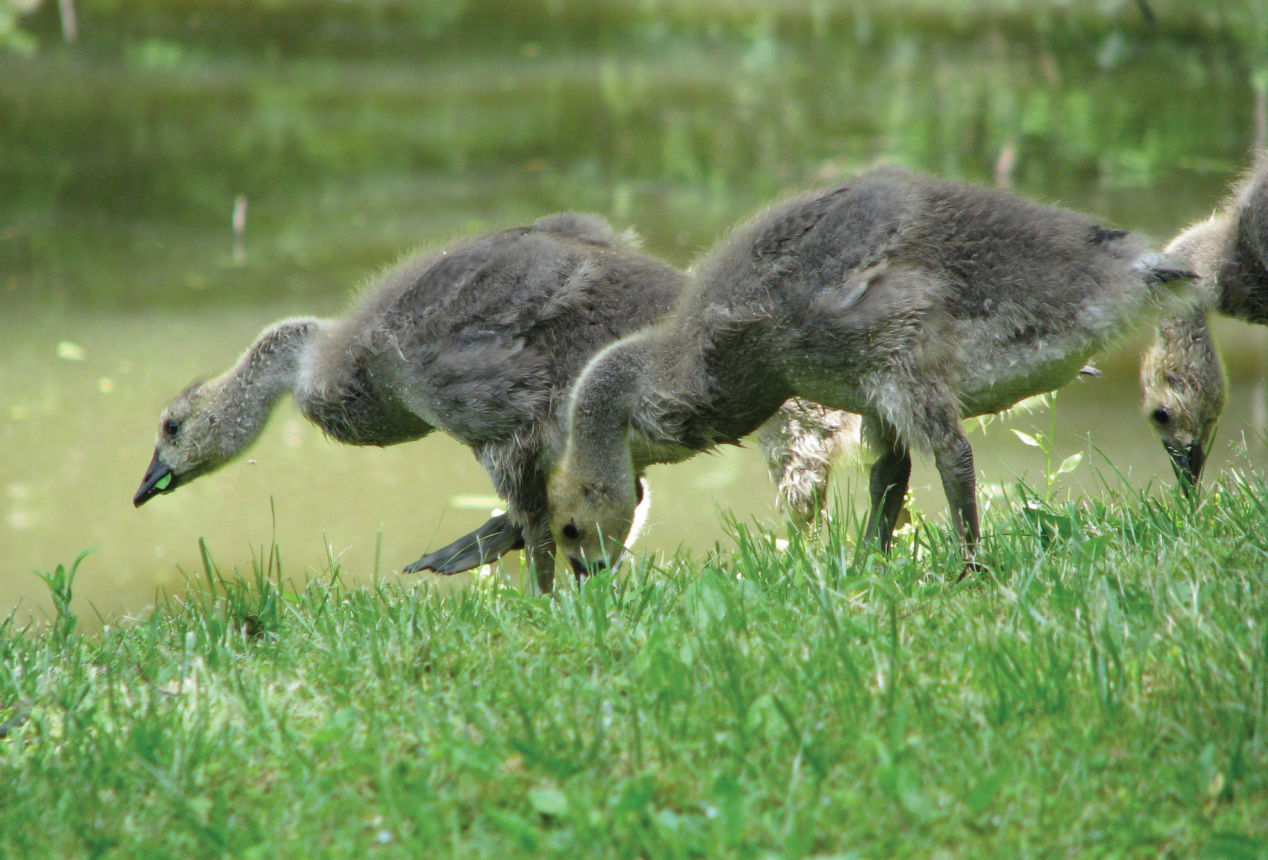
May 11 – Jonesboro