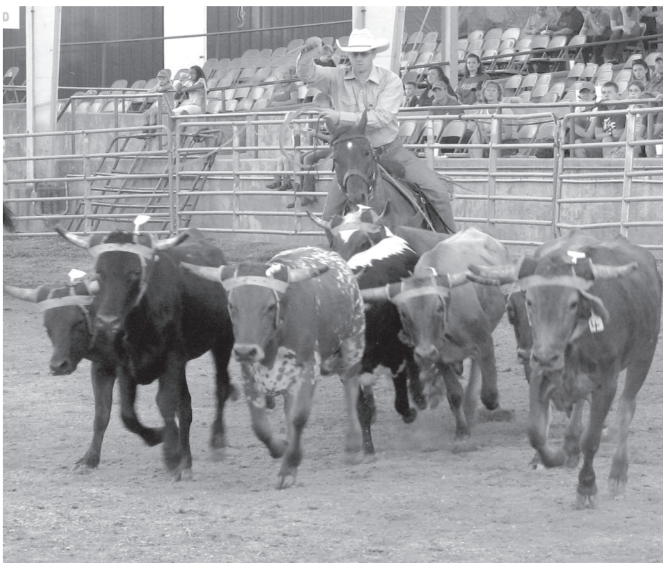
Ranch rodeo action.