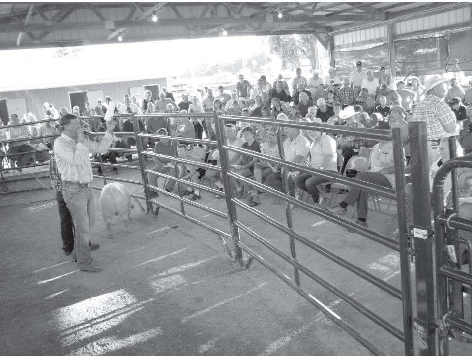
Many were part of the junior livestock auction.