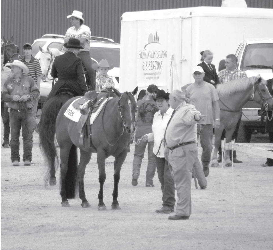
Getting ready for a horse show.