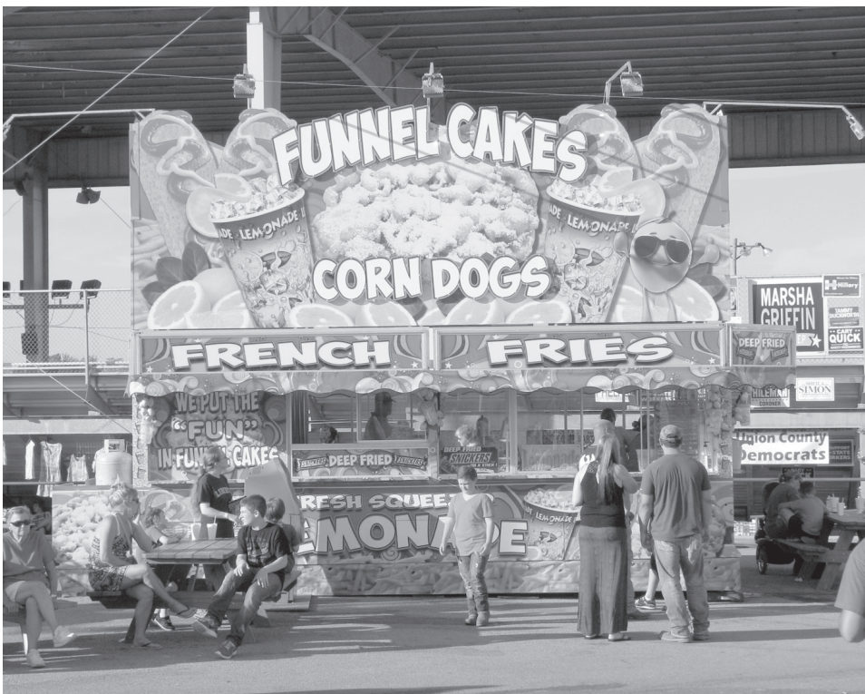
Fair food – always a favorite.