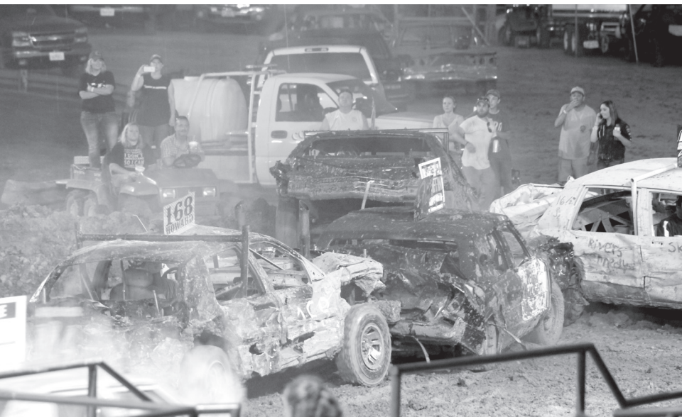
Demolition derby action.