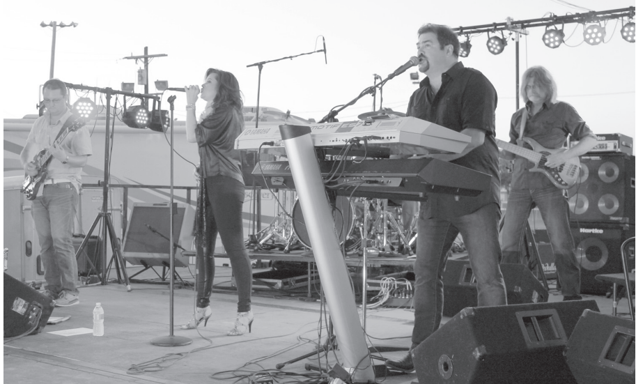
The Mainstreet Players.