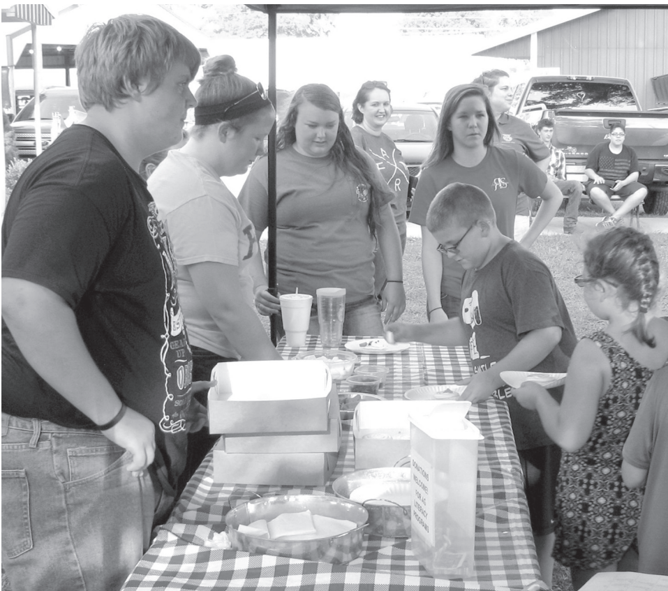
Making some special cookies.