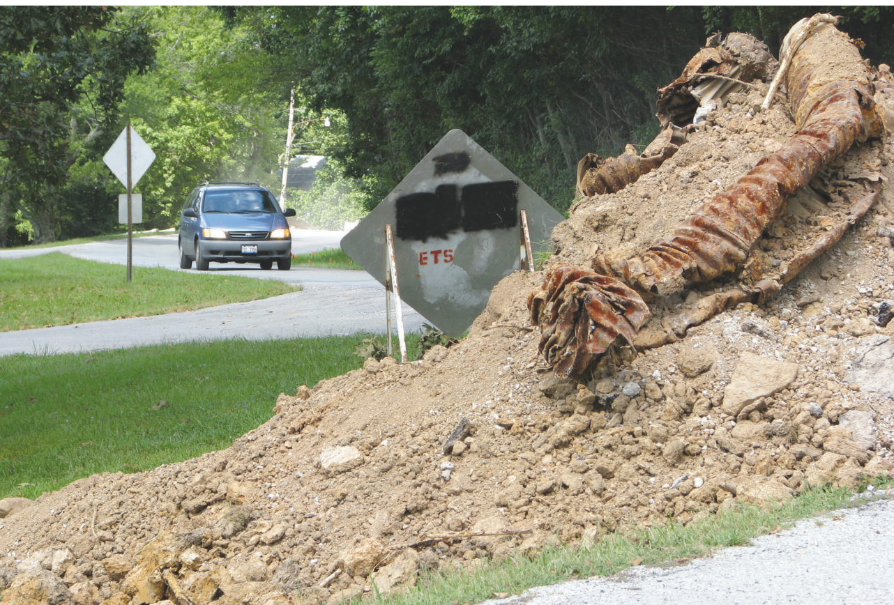
Skyline Drive project Signs of a construction work can be seen along Skyline Drive near Alto Pass as the result of a major improvement project which is underway on the Union County road. The picture was taken last Saturday.