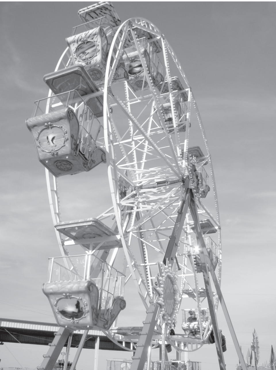
A Ferris wheel, all the way from Poland.