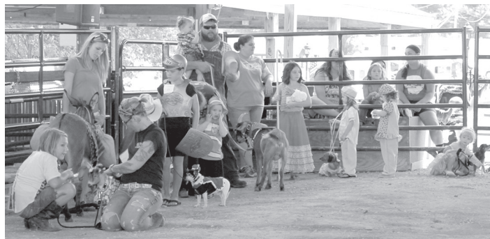
Another scene from the pet parade.