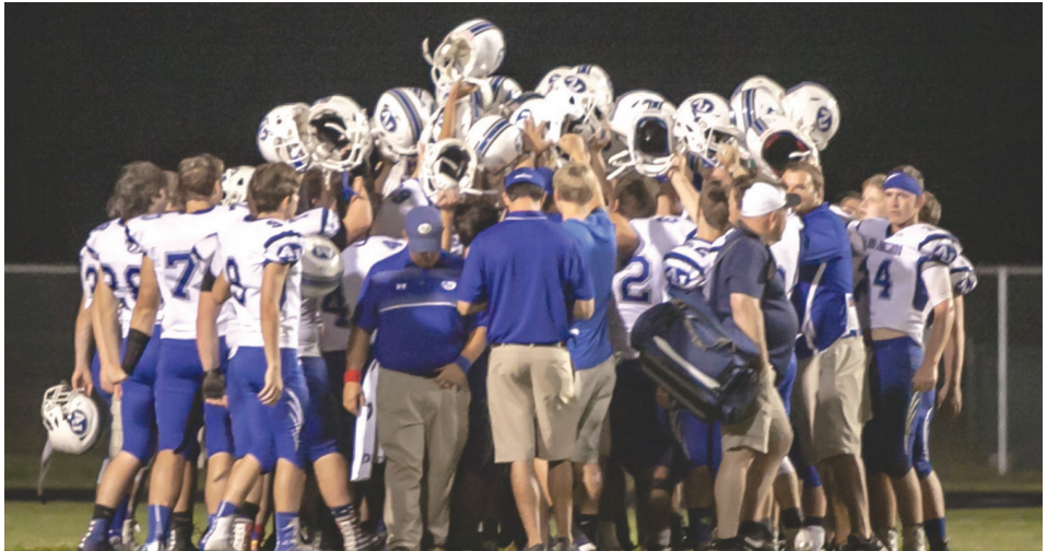
The Wildcats celebrate a big victory. With the win, A-J's record improved to 2-0.

Anna-Jonesboro posted a big road win against host Murphysboro in high school football action. The accompanying photographs highlight some of the action at the game.