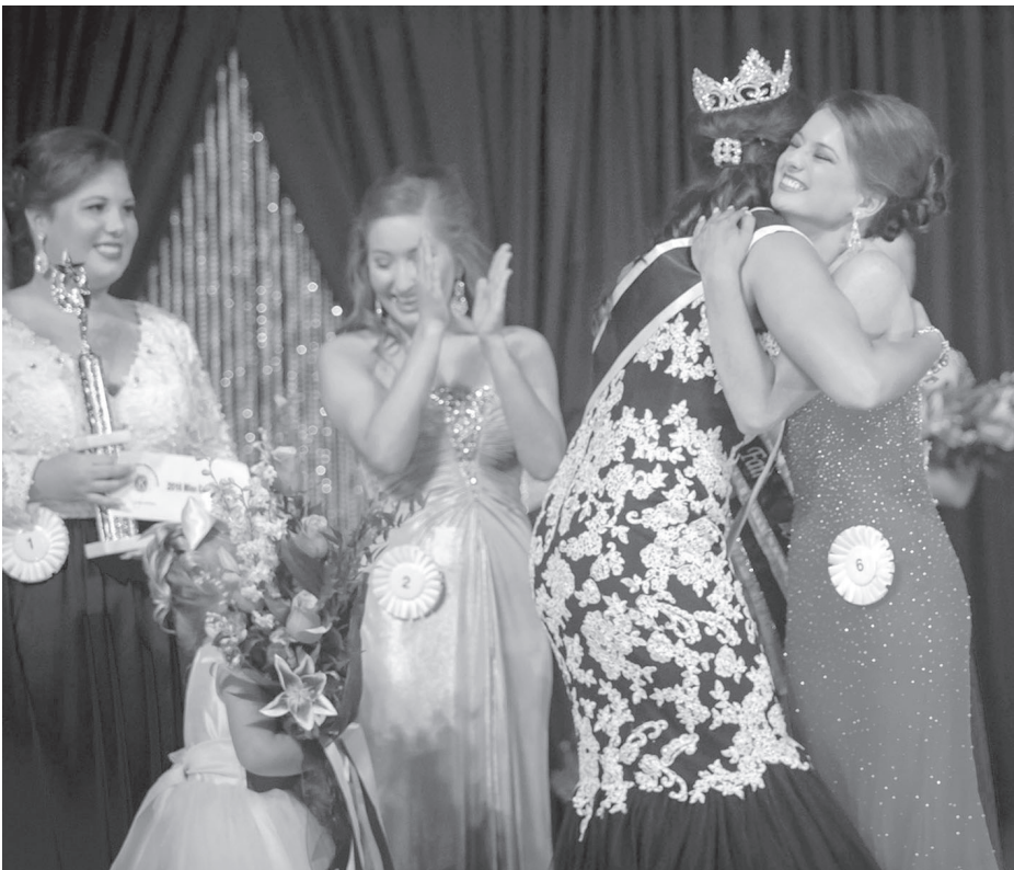
A new fair queen is crowned.