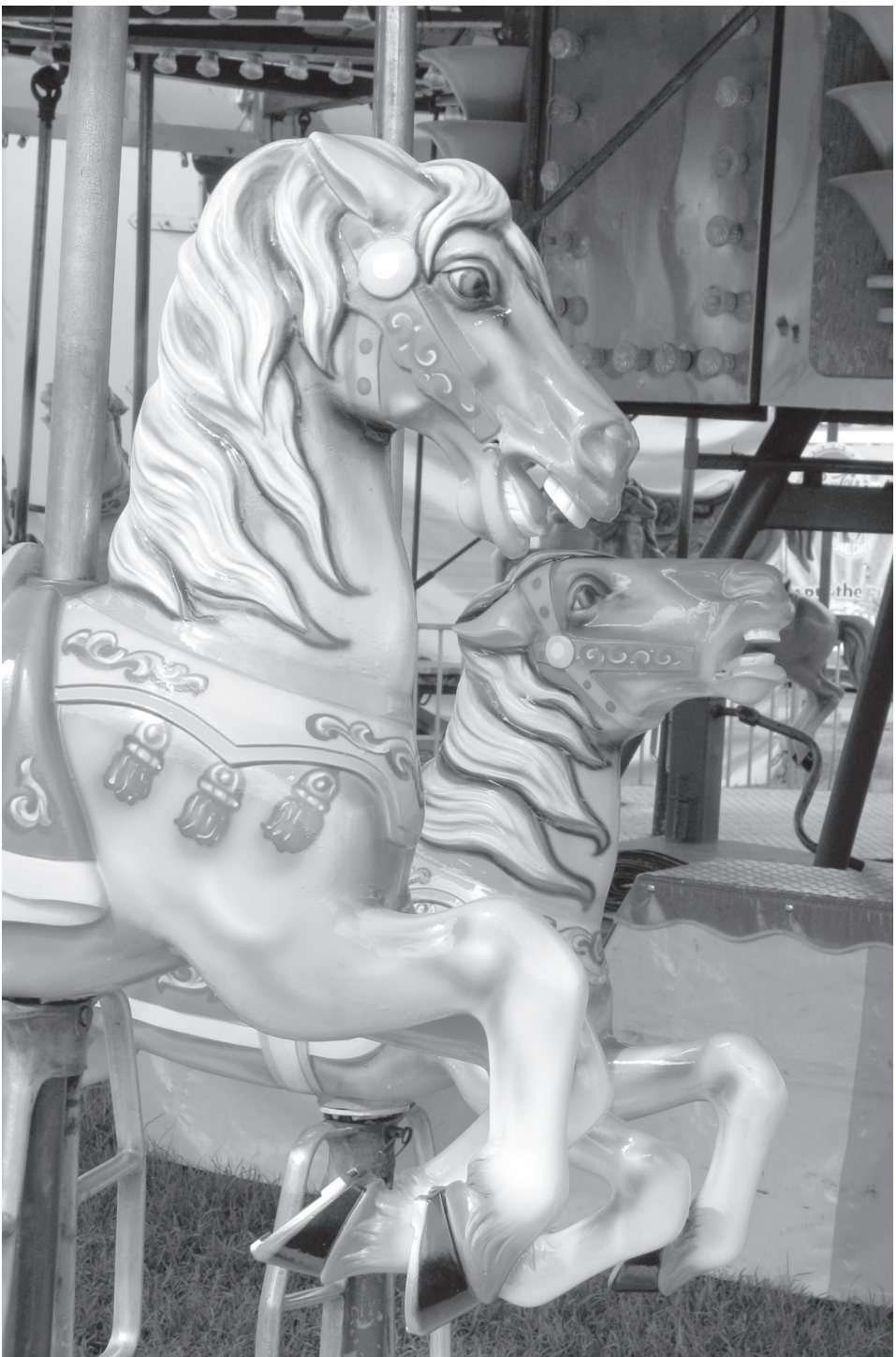
Horses on the midway's merry-go-round.