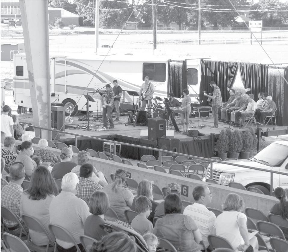
Community worship service.