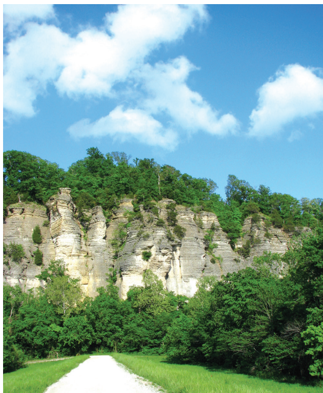
Limestone bluffs near the LaRue Swamp in western Union County. File photo.

SIU is ranked No. 21, the top Illinois university on the list.