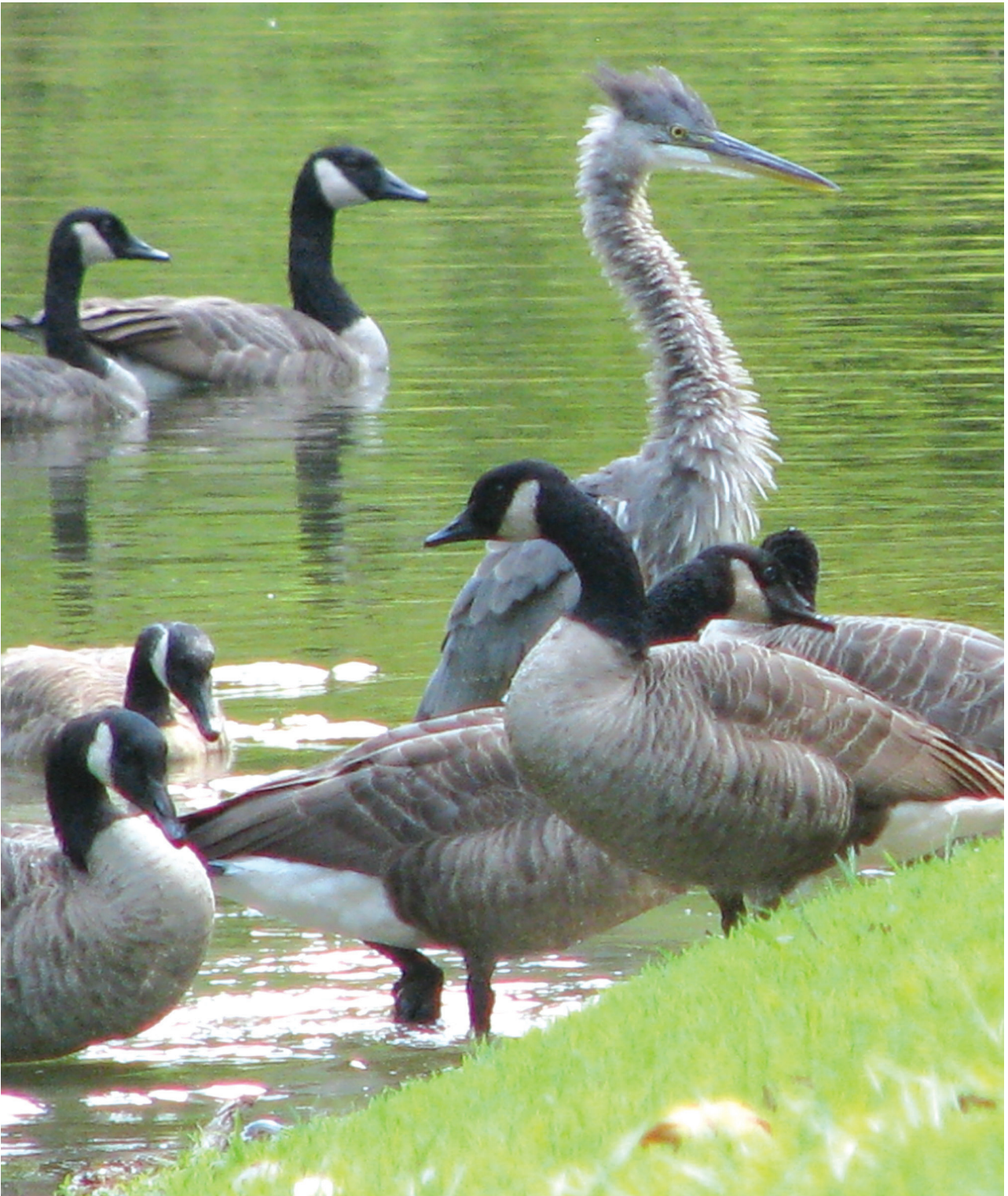
After a dip in the water, the heron looked a little scruffy. The geese did not seem to mind at all. And none of the critters really seemed to mind having their picture taken. Again. And again. And again...

Eventually, the geese moved on, as did the heron. I finished up what turned out to be a special visit to one of the very special places here in Union County. As I was leaving the picnic grounds, I nodded in the direction of a statue of Mr. Lincoln which stands at the grounds. I'm guessing he would have appreciated what had happened.