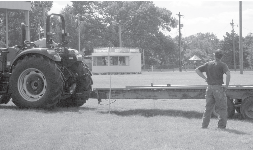
Junior tractor operators contest.