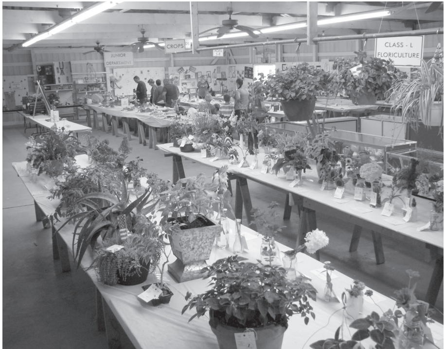
Displays in the exhibit building.