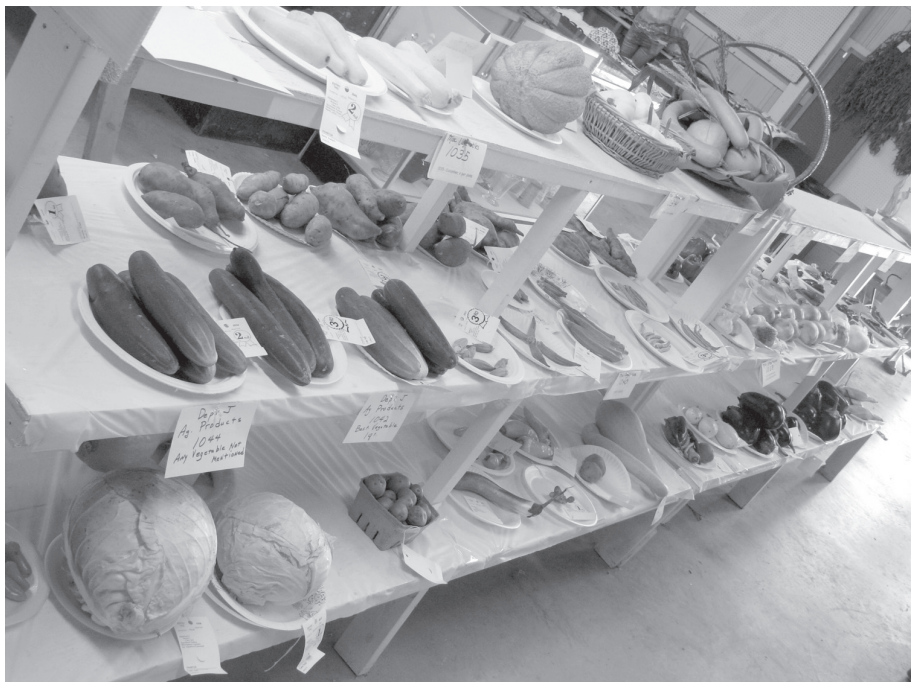
Produce on display.