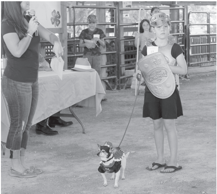
Pet parade participants.