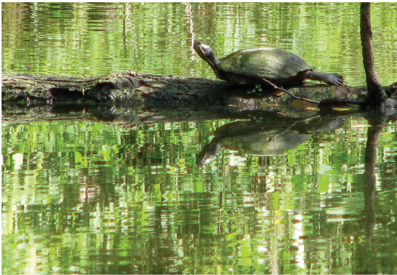
A turtle was basking in the late summer sunshine; the critter was on a log in the pond at the Lincoln Memorial Picnic Grounds in Jonesboro.